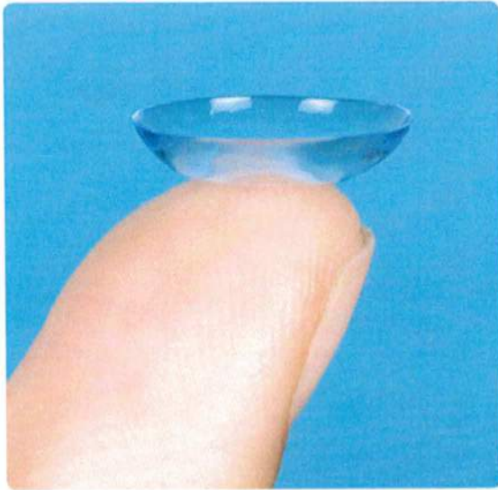
Soft contact lens